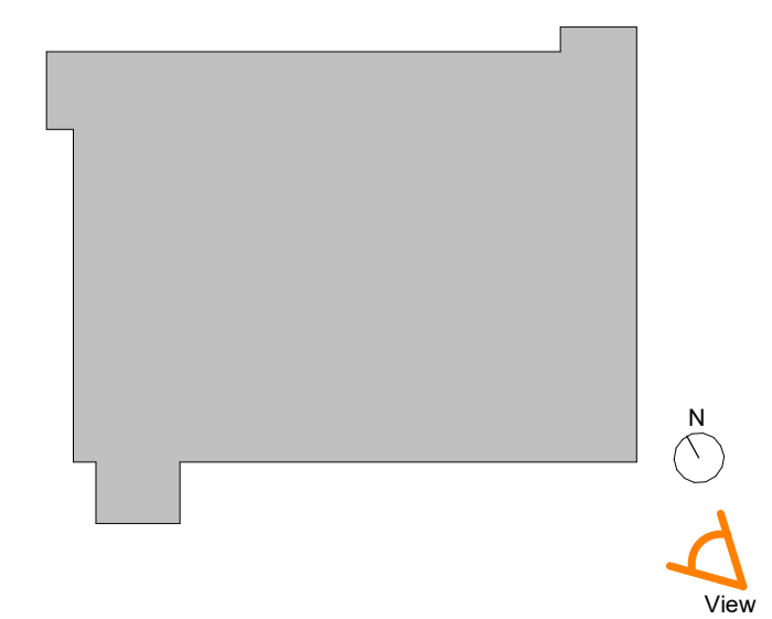
Key Plan (NTS)