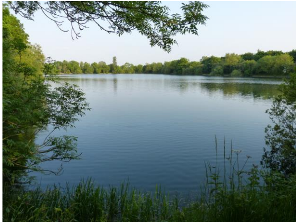
Figure 2: The view of Neigh Bridge lake from the Thames Path

It is these vistas which characterise Neigh Bridge Country Park. The sight of this body of still water, reflecting the surrounding trees, comes as a particularly pleasant surprise to walkers arriving from the north along the Thames Path; if they started their journey at Thameshead, four miles away, Neigh Bridge lake will be the first substantial stretch of water they encounter.