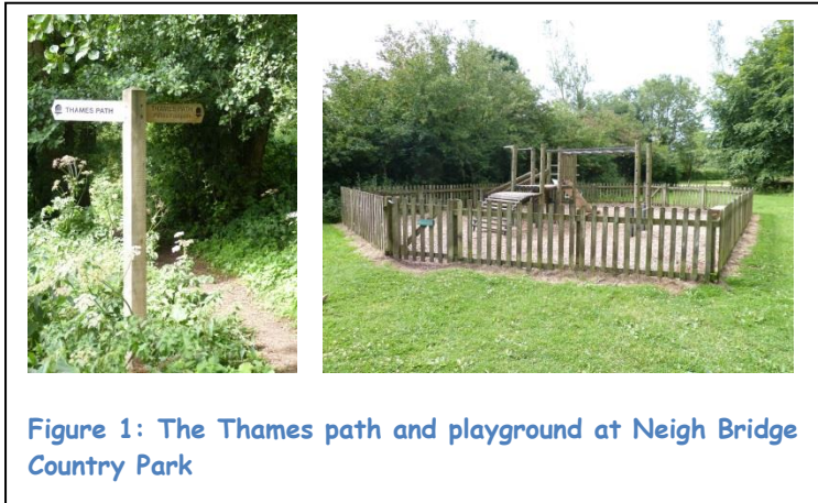
Figure 1: The Thames path and playground at Neigh Bridge Country Park

facilities at Keynes Country Park but they are further away, require the crossing of a main road and are less easy for small feet to walk to.