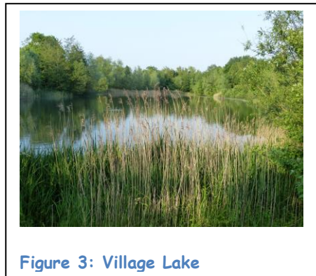
Figure 3: Village Lake

Gravel extraction was completed at Village Lake in 2003 and since then the site has been left in relative peace. The absence of a car park means that visitors to the site have to get there by foot or cycle, and its small size makes it less inviting to day trippers than nearby Neigh Bridge Country Park. It will be managed to maintain this feeling of tranquillity and intimacy so that it remains an attractive place for local people to visit.