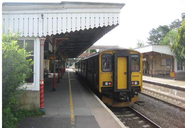
Kemble Railway Station

2.0.21 In 2011, almost 14,000 residents commuted out of the District; many using the area as a rural base from which to commute to larger employment centres, notably Swindon, Cheltenham and Gloucester, where there are higher value jobs. Conversely, almost 16,000 commuted into the District, an increase of around 5,000 since 2001 (12) . Over 16,300 Cotswold residents also work in the District, excluding homeworkers and people with no fixed working location. Given the rural nature of the area, average travel-to-work times are longer than in most other parts of the County.