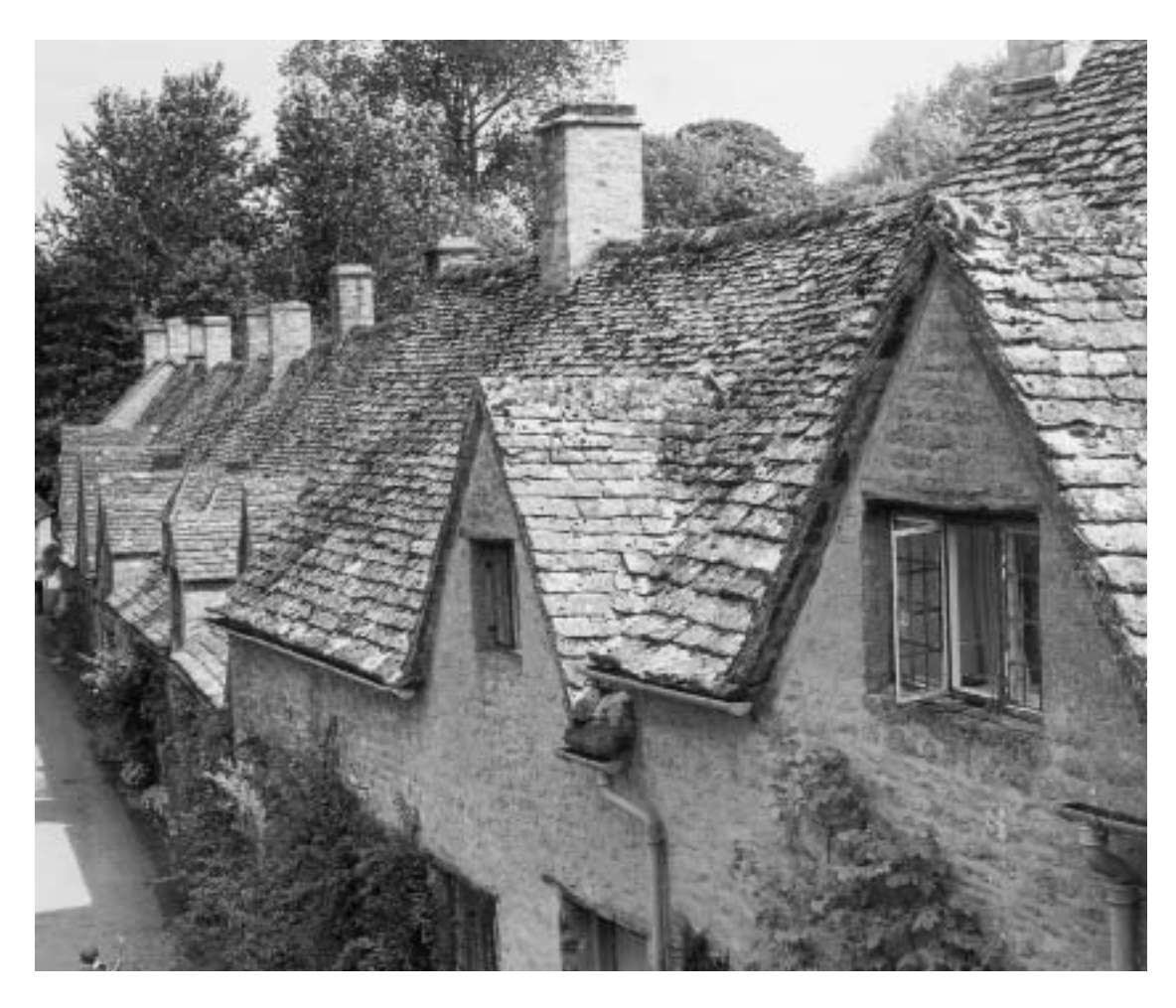
This view of the roofs of Arlington Row in Bibury illustrates many of the craft techniques that form part of the Cotswold stone slate roofing tradition, which this guide describes.

Forest Marble is split by hand very shortly after being extracted from near the surface of the ground, usually at a small quarry. At one Cotswold quarry where slates were, until very recently, made by this method, it was thought that they should only be split within a few days of being extracted, while they still retained their natural moisture, or 'quarry sap'. Such stone slates are called 'presents'. This is the oldest method of producing Cotswold slates, probably dating from the Roman period.