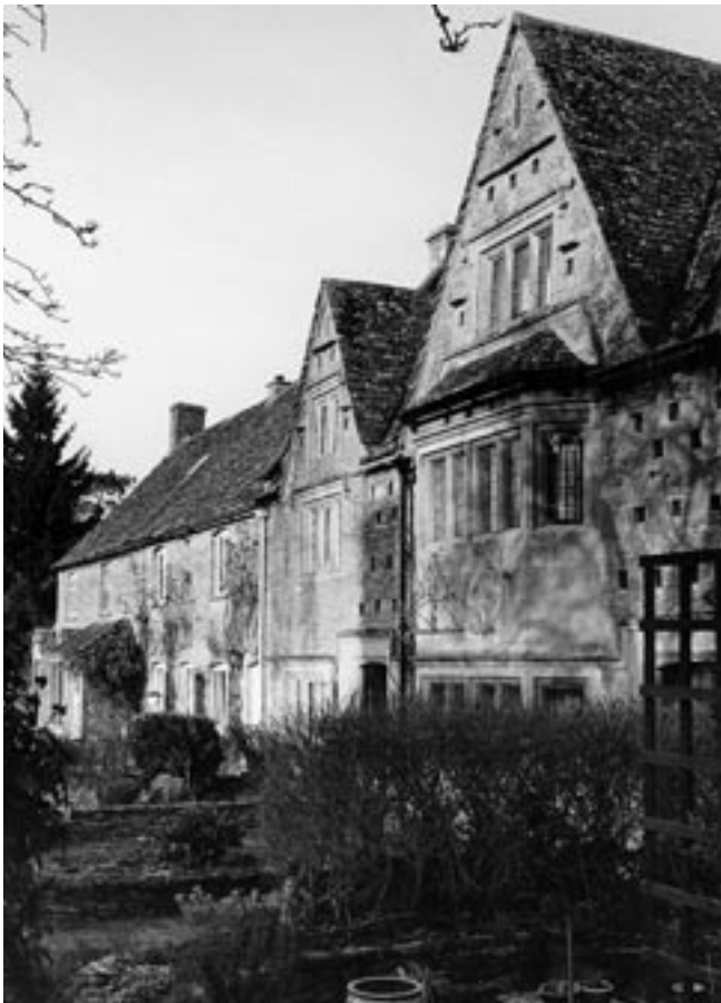
One of the many listed buildings within Bourton. Changes to listed buildings need to be handled sensitively to protect their special character, or setting.