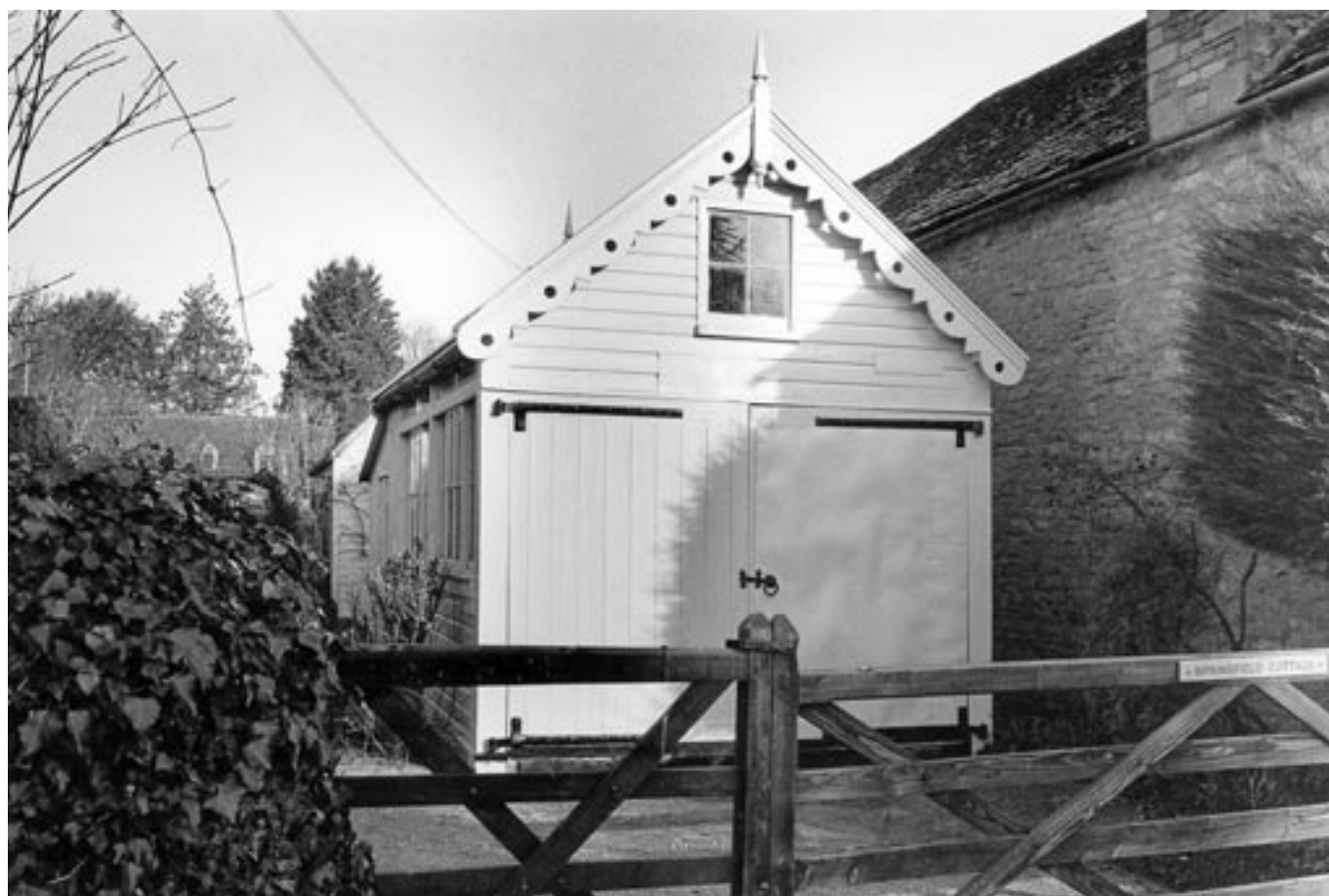
The attractive timber garage adjacent to Springfield Cottage is a unique and distinctive feature within the conservation area.

Across the road, the High House on the corner of Clapton Row is a pleasing, unaltered building with simple, iron railings and a gate delineating its forecourt. Sadly, many of the properties along the row have been spoilt by the incorporation of inappropriate replacement windows. Simple, forecourt railings, which are such a feature of Bourton, survive here in large quantity.