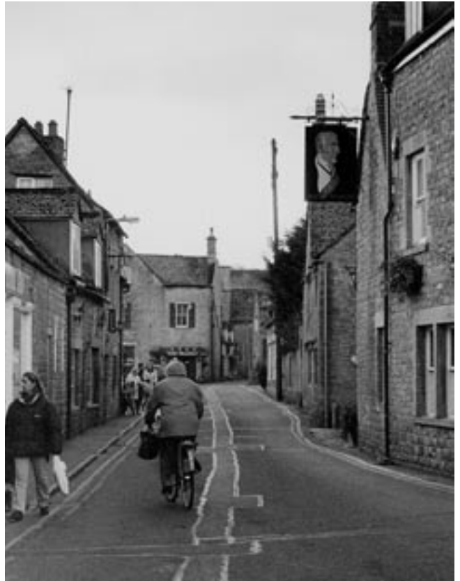
Moving south down Sherborne Street, the road narrows considerably near to the Duke of Wellington. The Warren provides a key terminal feature where Bow Lane and Sherborne Street divide.

The majority of the buildings along this lane have little architectural distinction having been subject to many alterations. Nevertheless, the lane's character is reasonably pleasant and intimate, and its juxtaposition of buildings and their distinctive yet similar style creates a lively sense of spatial interest.