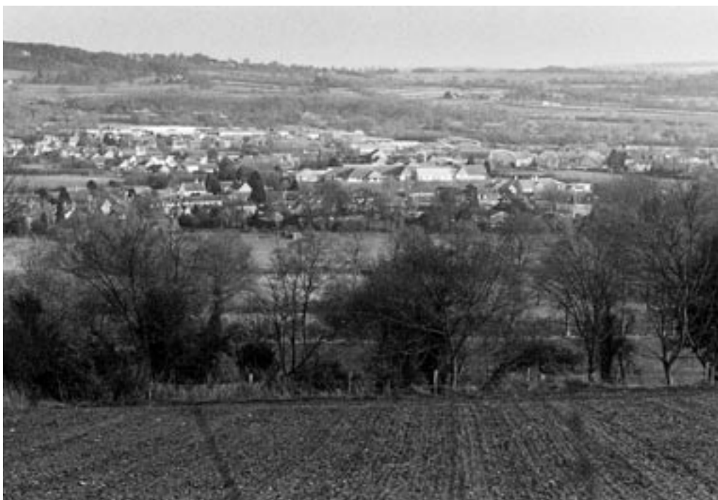
The village of Bourton-on-the-Water sits in the Windrush valley, encircled by the tree fringed 'wold' plateaux edge.

The original siting of a settlement at Bourton-on-the-Water was undoubtedly influenced by the wealth of natural resources in this location - water from the River Windrush and high quality agricultural land in the delta between the Windrush and the Dikler. However, man-made features have also had an impact. The line of the Fosse Way is particularly noticeable here, cutting a straight line through the landscape to the west of the village, at right angles to the route of the River Windrush. The line of the more modern, but now redundant and dismantled railway is also clearly visible, both within the village and in the surrounding landscape, highlighted by embankments lined by trees.