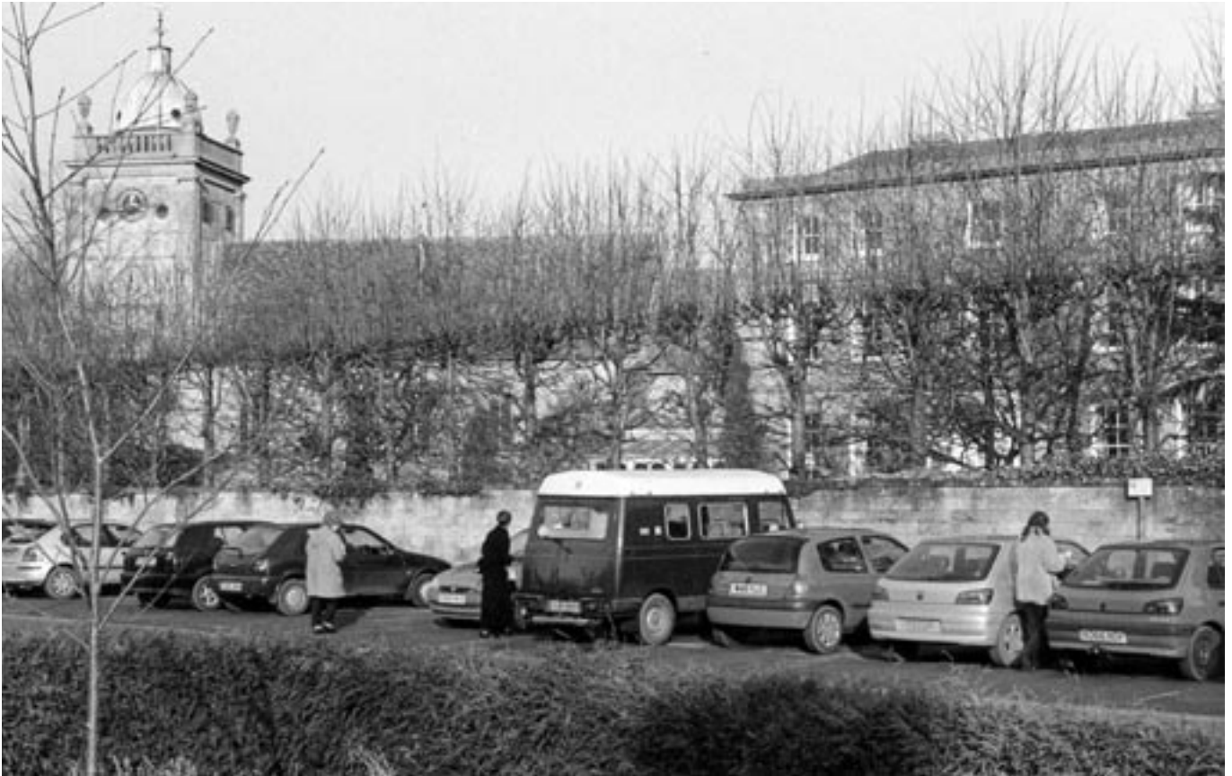
St. Lawrence's Church and The Rectory can be glimpsed behind a long ashlar wall. This borders the High Street and is backed by a row of pleached Limes.

panelled fencing behind its roadside dry-stone wall. However the removal of the incongruous Leyland Cypress trees directly behind this has considerably enhanced the conservation area. The view back is not of any merit, being largely composed of modern buildings.