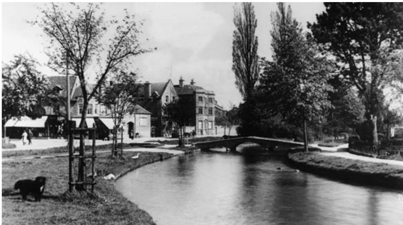
A view of 1930's Bourton. This placid scene contrasts with today's busy and vibrant village centre.

Bourton-on-the-Water's history dates back to Anglo-Saxon times following the establishment of an early Iron-Age camp, built on the highest part of the vale and known as Salmonsbury. The name Bourton itself is Saxon in origin, derived from the words burh meaning fortification or camp, and ton, which means estate or village. The combination of these words can be taken to mean 'the village beside the camp'.