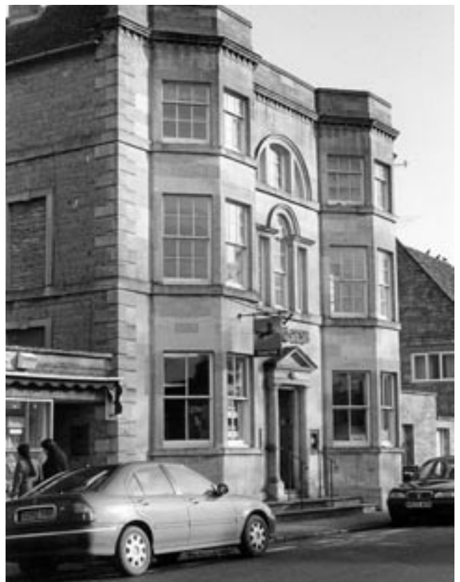
Lloyds Bank occupies a grand, late 18th Century former house. This displays classical features of that date, including diocletian windows, a pedimented doorcase, rusticated quoins and full-height canted bay windows.

Around this central space, certain buildings stand out as providing the key, character-defining features. On the north-east side of the road, the old forge (now tea rooms) displays fine classical architecture, the sash windows having fully moulded architraves and pediments. The pedimented doorway was large enough for horses to be led through to be shod in the forge to the rear. Nearby, Vine House, a more traditionally Cotswold building, has resisted commercialism by retaining its original external features, and the Dial House Hotel, set back beyond a small triangular green, is a fine late seventeenth-century building. Back onto the street frontage, Lloyds Bank is a grand late-eighteenth century former house, with classical features typical of that date, especially the ‘Diocletian windows’, pedimented doorcase, rusticated quoins and full-height canted bay windows. The quality of all of these, and other buildings in the centre of Bourton, is often obscured by the commercial and tourist activity around them.