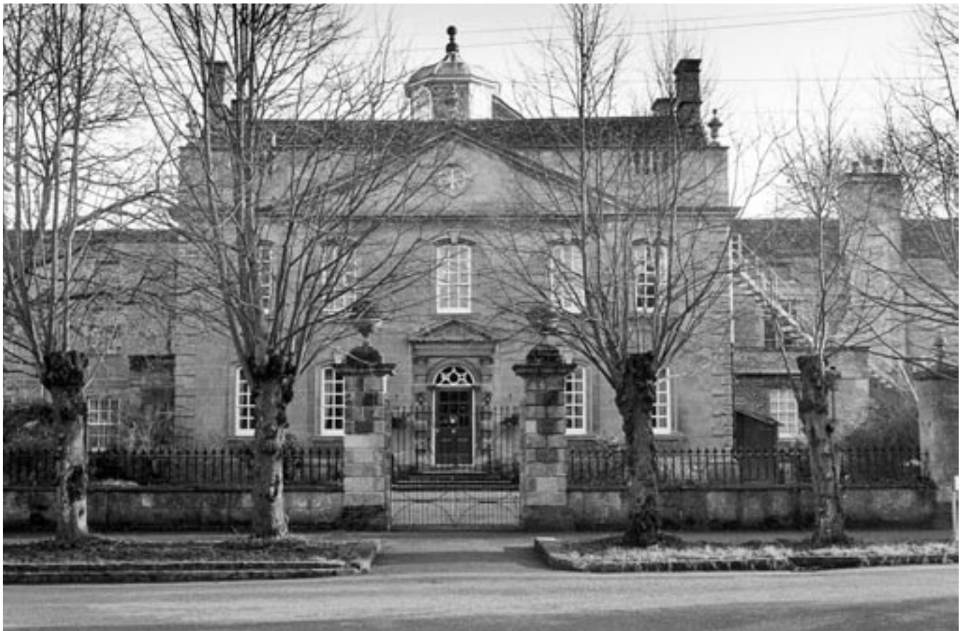
The fine palladian facade of Harrington House can be seen behind low walls, topped with spearhead railings and linked to rusticated gatepiers, all of which contributes greatly to the character of the conservation area and deserve careful consideration.

Looking towards the village centre the view focuses on the old forge, with its fine doorway. This street narrows considerably near to the Duke of Wellington on the left. Roofs run both parallel to the road and at right angles to it and, as throughout Bourton, varied roof-lines and the lively silhouettes provided by chimney stacks, form an important part of its architectural character. The paving in front of the Duke of Wellington is worthy of mention because these blue clay pavements appear to be an important historic feature in