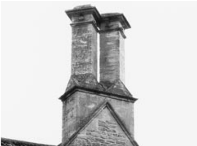
Several buildings in Bourton have diagonally set chimney stacks, occasionally rising laterally from the side walls, as seen here at Riverside House.

Together with the walls, forecourt railings are much in evidence, varied in design and infinitely pleasing. Good examples of simple, iron gates exist, those serving the church, the Manor House and Harrington House, are especially worthy of note. More ebullient, wrought iron gates are found at Sherborne House.