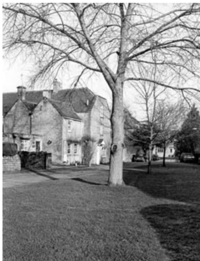
Clapton Green is a pleasing open space within the conservation area.

The junction of Bow Lane and Victoria Street is disappointing. The north-western part has a preponderance of high stone and reconstructed stone walls and buildings that deserve to be relieved by tree planting. Bow Lane itself is rather harsh, being an area of tarmac tightly defined by good stone walls and outbuildings on the north side. The continuity afforded by these features is, unfortunately, lost by the wide vehicle entrances as one approaches the rear of