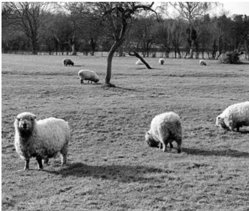
The agricultural and un-manicured character of the water meadows behind the Lansdown end of the High Street is in sharp contrast to the more urban, formal parts of the village centre.

The riverside footpath joins Lansdown at the Mill House and this building provides an important focal feature as one proceeds westwards along the footpath. In periods of low winter sunlight the ridge and furrow of the water meadows that have not been ploughed stands out in sharp relief. The continued agricultural use of these meadows is particularly appropriate. This is an old, un-manicured and pleasing area, a great contrast to the urban, formal part of the village centre.