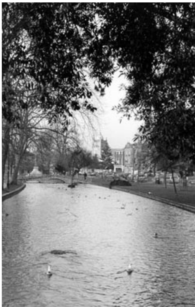
The river dominates the centre of Bourton and provides a focal point for visitors to the village.

It is remarkable that such marked contrasts in character can be found in such close proximity; the river as far as the Mill Museum being a quiet, sequestered place, whilst below the Broad Bridge, children paddle in its waters and ducks flock to be fed. Visitors picnic along its banks and sail boats in its smooth though lively waters. Out of season, however, the