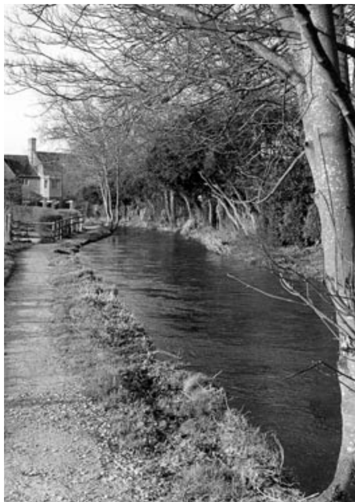
The footpath running behind the grounds of the Manor House links Lansdown with Sherborne Street.

At the north-western end of the High Street, the conservation area starts at Church House, a pleasing Edwardian building that stands in gardens edged by high stone walls. These are sited close to the road and immediately suggest that one is approaching the heart of the village. The buildings on the right hand side of the road also stand well forward and have attractive railings. This close relationship of walls, trees and buildings creates a feeling of anticipation as the street curves to the left. It is unfortunate that Naight Cottage has timber