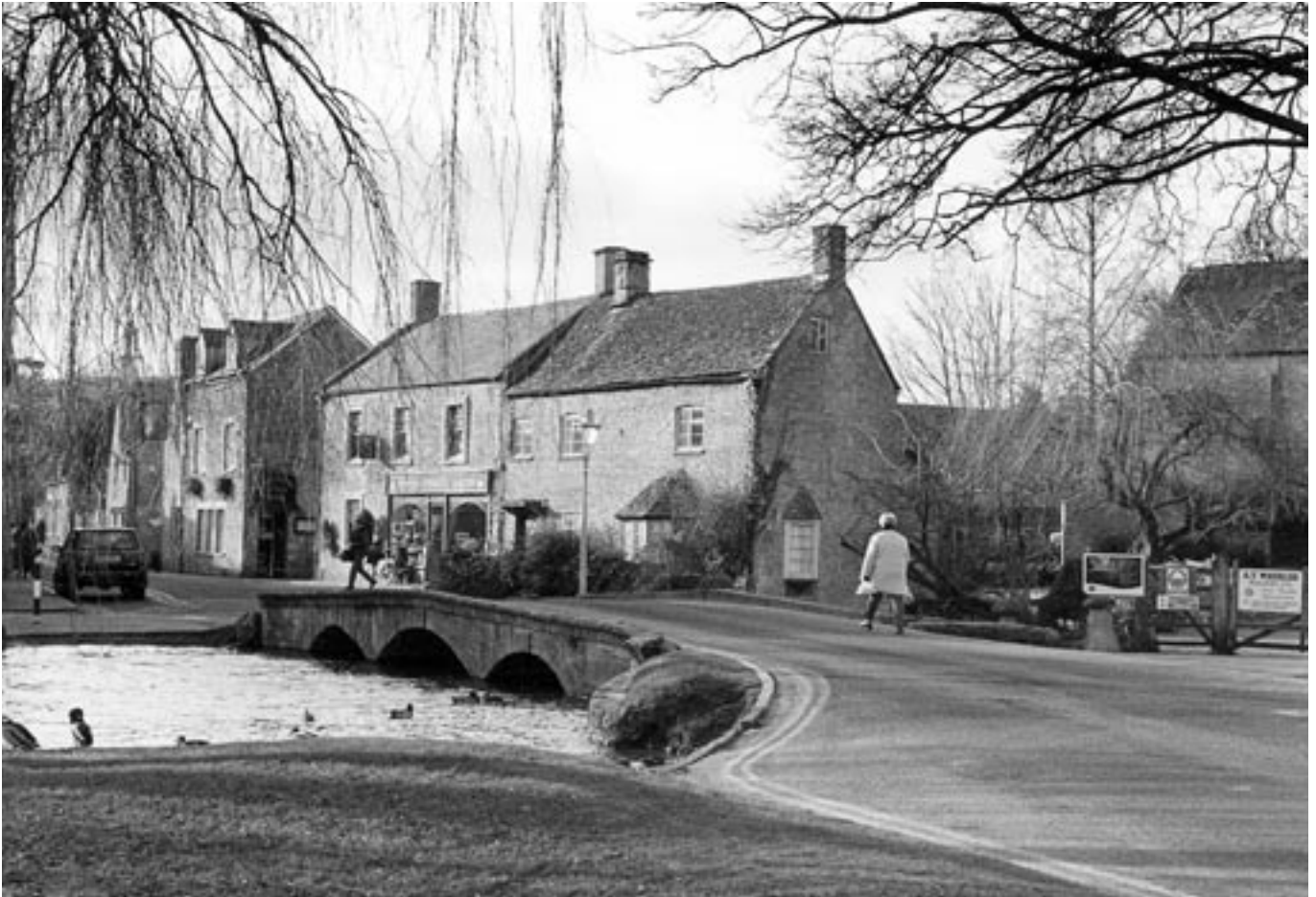
The original focal point of the village was roughly the middle of the High Street. The main bridge over the river at this time was Mill Bridge.

Bourton-on-the-Water Conservation Area was first designated on 7 July 1971, and the boundary was altered on 1 June 1989 and 11 January 2000.