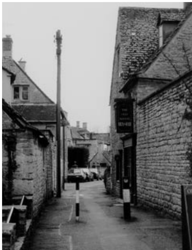
The lane running behind the Rose Tree Restaurant is hemmed in by tightly packed cottages and boundary walls, resulting in a pleasant and intimate character.