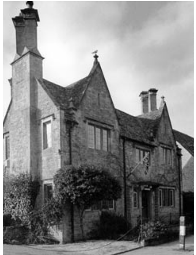
The Cotswold Tudor Revival style house 'Fairlie' is set back from the river and is characterised by steep gables topped by finials and paired diagonal chimneys.

The Rissington Road approach from the Cricket Bungalow is quite rural in character despite the car park on the left hand side, and the former council housing on the right. The road is lined with wide grass verges, and furnished with ample tree planting. The brook which runs along the south-west side of the road introduces the watery theme which becomes prevalent throughout the village. The Windrush flows closely