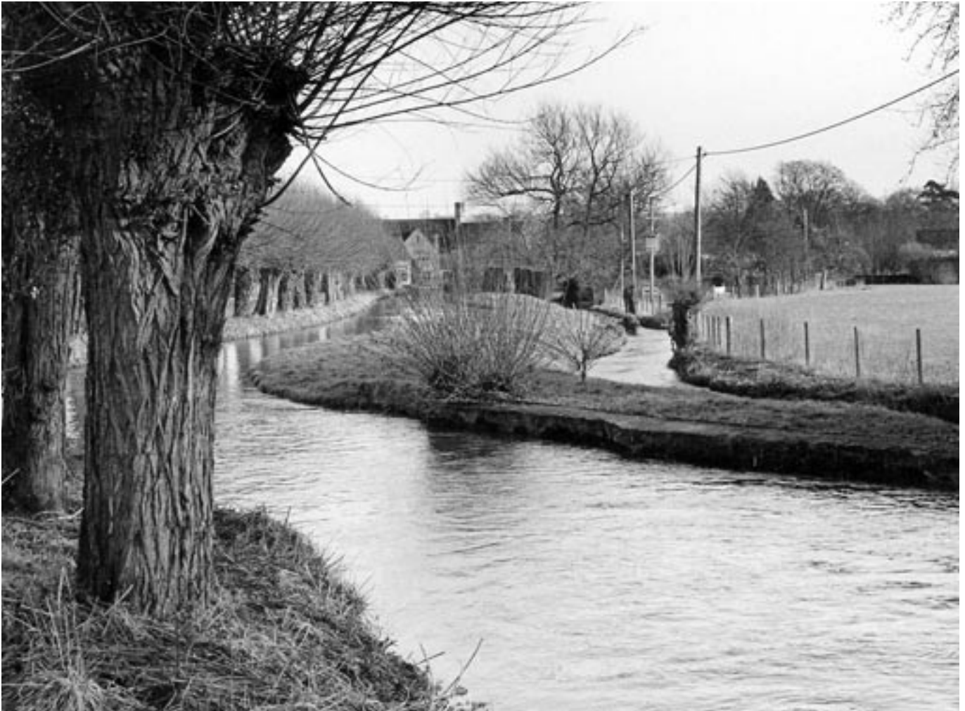
The western approach to the village is characterised by the River Windrush running alongside the road and lined by an impressive row of mature, pollard willows.

The north side of the road is best described as mature suburbia. Most properties, some dating from the inter-war period, are set well back from the road and have large gardens surrounded by dry-stone walls and hedges. Running east from the Mill House, High Street weaves its way towards the village centre, and a footpath runs beside the river to Sherborne Street.