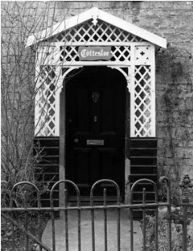
An attractive trellis porch is an eye catching feature.

Throughout the village, stone boundary walls, dry-stone and mortared, play very important roles in defining roads and footpaths, and linking buildings together. In an area where the craft of the stone mason was important, moulded chimney caps and ball finials are a frequent delight.