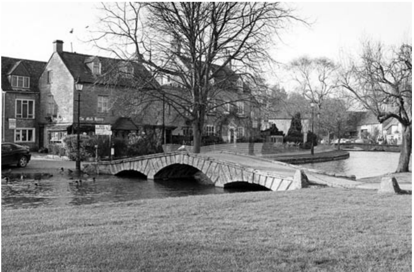
The undeniably picturesque village centre, with the River Windrush flowing beneath attractive, low, stone bridges, is bordered by wide village green and buildings set back respectfully.

The footpath, leading past the Dial House Hotel at its eastern end, is the route by which most coach-borne visitors reach the centre of the village. It is enclosed along its first stretch by tall dry-stone walls, although its character changes once the junction with the path leading from Station Road to the Avenue is reached. This route is currently paved in tar macadam, and it would be beneficial if it were to be re laid in a more traditional material.