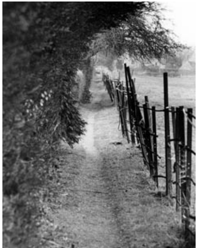
The footpaths which link Station Road with others near Burghfield deserve tidying up to preserve the traditional scene. The repair of the remaining horizontal, iron parkland railings and the replacement of other unsuitable fences with this type would enhance this part of the conservation area.

Burghfield House itself is a handsome, Georgian building with distinctive bay windows. The wooded grounds contain two fine, specimen Cedars of Lebanon. Despite its proximity to the village, Burghfield still maintains the character and appearance of a country house, surrounded by parkland. Unfortunately, some of the paddocks and footpaths are poorly fenced with posts and wire. The traditional and correct fencing would be horizontal, iron, parkland railings. The