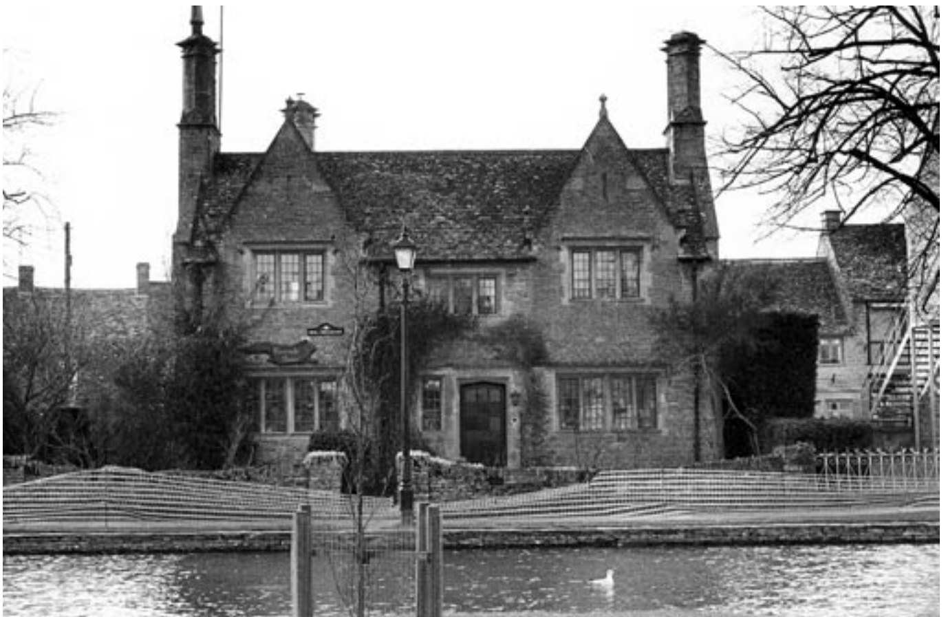
Riverside House displays many traditional features of the Cotswold Style such as a steeply pitched natural stone slate roof, diagonally set, ashlar chimney stacks, coped gables with finials, and mullioned windows with hood-moulds.

Several examples of good lattice porches exist (at Cottesloe in High Street, for example) and the door case on the old forge is worthy of particular mention. The dormer window on this building is a crowning feature and dormers of a similar style, though with shallower pitches, are found on the building behind Polly Perkins and Oliver and Newman. This building, like so many more in the centre of Bourton, has been disfigured by the incorporation of insensitive shop fronts.