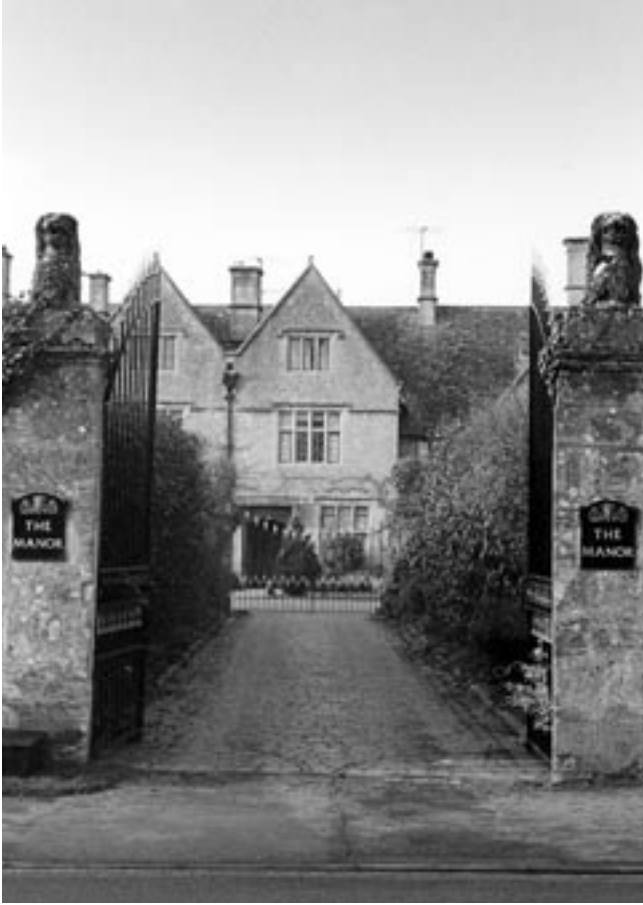
The front of the Manor (which dates from the 17th Century) can be glimpsed between a pair of ashlar gate piers on Station Road.

The view is terminated by a row of houses, now entirely adapted to form shops.