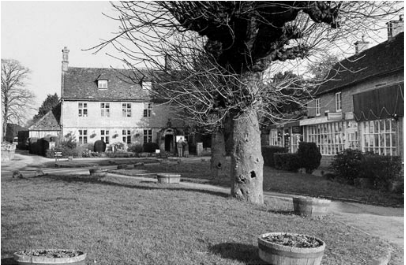
The small green separating the Dial House Hotel with the High Street is at its best when uncluttered by the presence of bollards, tubs and signs.

Also, the modern paving in front of many of the shops is regrettable. Historically, blue clay paviments appear to have been used in Bourton and these would be far more appropriate than the patterned concrete paviments that have been introduced in recent years. Modern bound aggregates, which imitate stone hogging, would also be appropriate here.