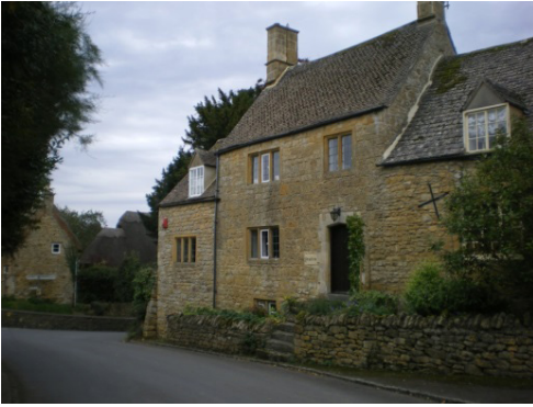
Figure 3: Character Area One - Central: House at junction of Hidcote Road and Campden Road.