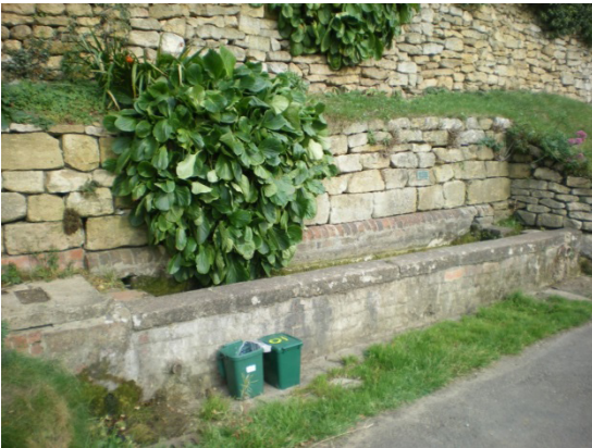
Figure 6. Character Area Two - East: Public water trough (Grade II Listed)