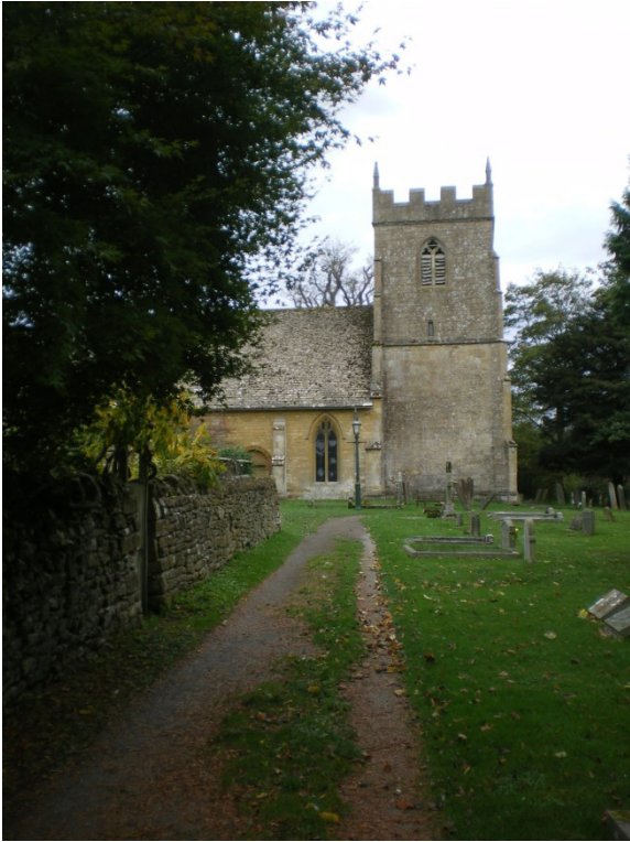
Figure 8. Character Area Three - West: The path to the churchyard looking south