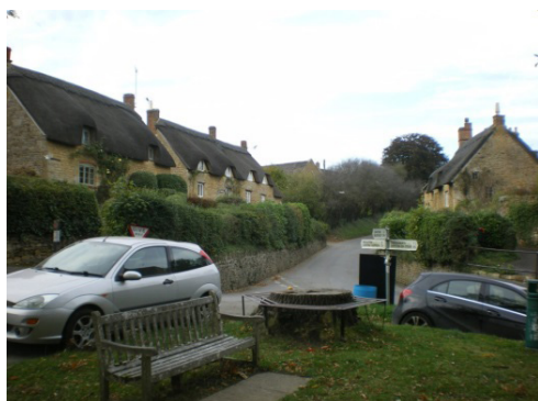
Figure 1: Character Area One - Central: View north towards the green, with listed cottages set above the road.