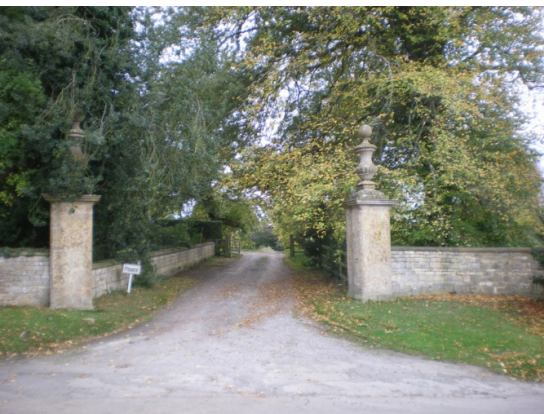
Figure 7. Character Area Three - West: Entrance to Ebrington Hall