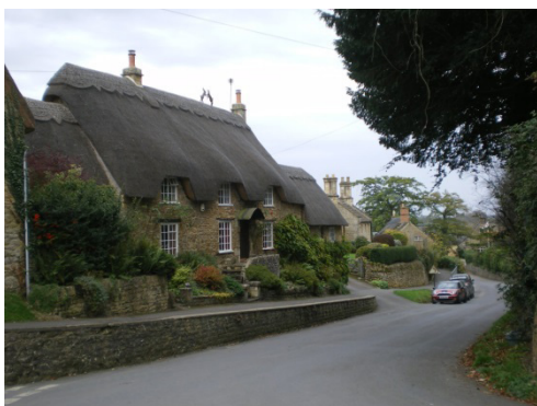
Figure 2: Character Area One - Central: Street view south from the junction between the northern Hidcote Road and the Campden Road to the west showing raised pavements.