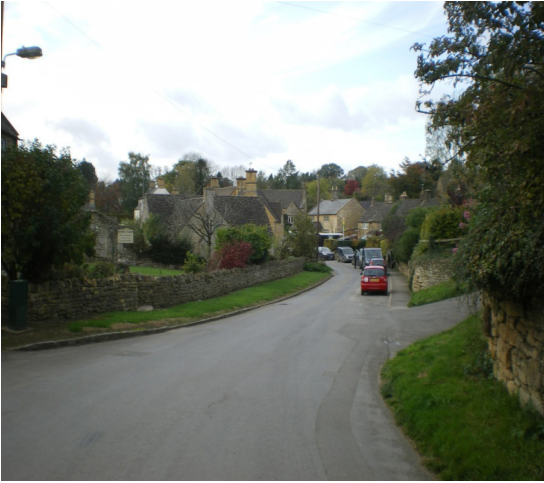
Figure 5. Character Area Two - East: View west back towards the Green showing a predominance of dry stone boundary walls and hedging beyond.