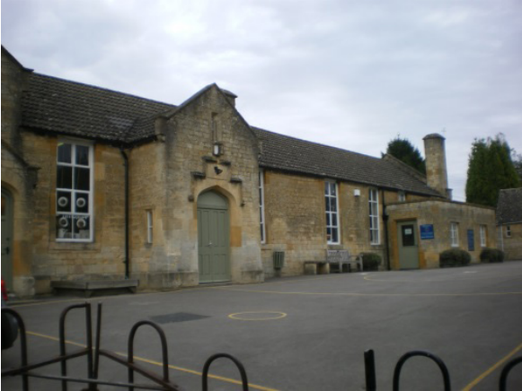
Figure 12: Ebrington School (dating to 1840s, and still in use as the village school) (unlisted).