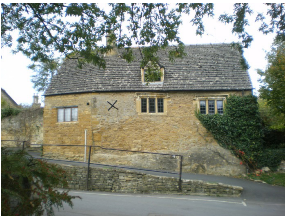
Figure 9: The Old Forge on the Green (unlisted)