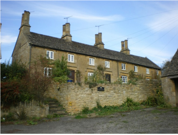
Figure 10: Terrace of 19th century cottages known as Longwell Bank (unlisted)