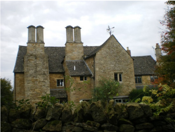
Figure 11: 13th Century Harrowby House west elevation (Grade II* Listed).