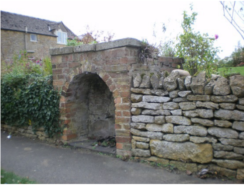
Figure 4: Character Area One - Central: Public water conduit on the east side of Hidcote Road.